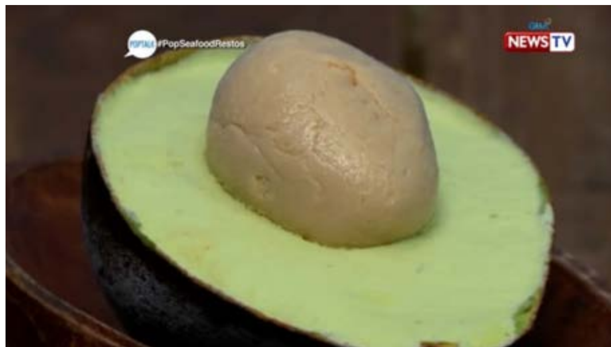
POP TALK - GMA NEWS TV