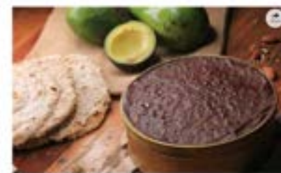
The Dark Mocha Avocado Protein Cake is the latest treat from Avocadoria.

[SPOT.ph] There's something that's still so novel about Sin cakes that people can't seem to get enough of. We've seen a variety of flavors, from classic chocolate to red velvet , and it appears that Avocadoria is looking to switch things up a little. Enter their new Dark Mocha Avocado Protein Cake (P100)—a right mouthful in more ways than one.