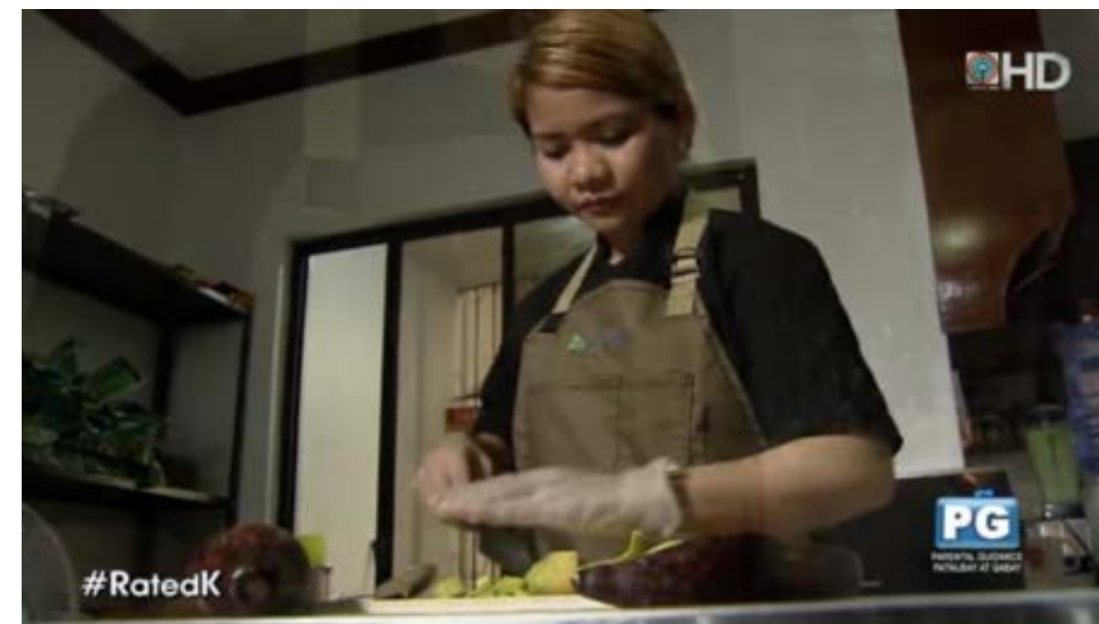
RATED K - ABS CBN