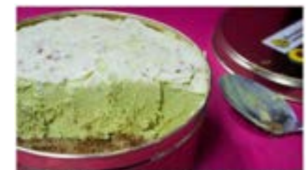
Avocadoria's Avocado Ice Cream Cheesecake (P100) is made with layers of graham crust, avocado with cream cheese, and a white chocolate shell.

15.5K Shares | Facebook | Twitter | Email | Comment