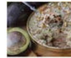
Avocadoria: Avocado Saus Bread Cake

This creamy, nutty, buttery fruit is more than that. Avocados are such a versatile ingredient that you can use them in so many desserts. If you want to try avocado desserts beyond the avocado-and-milk combination, here are the different places that offer avocado desserts.