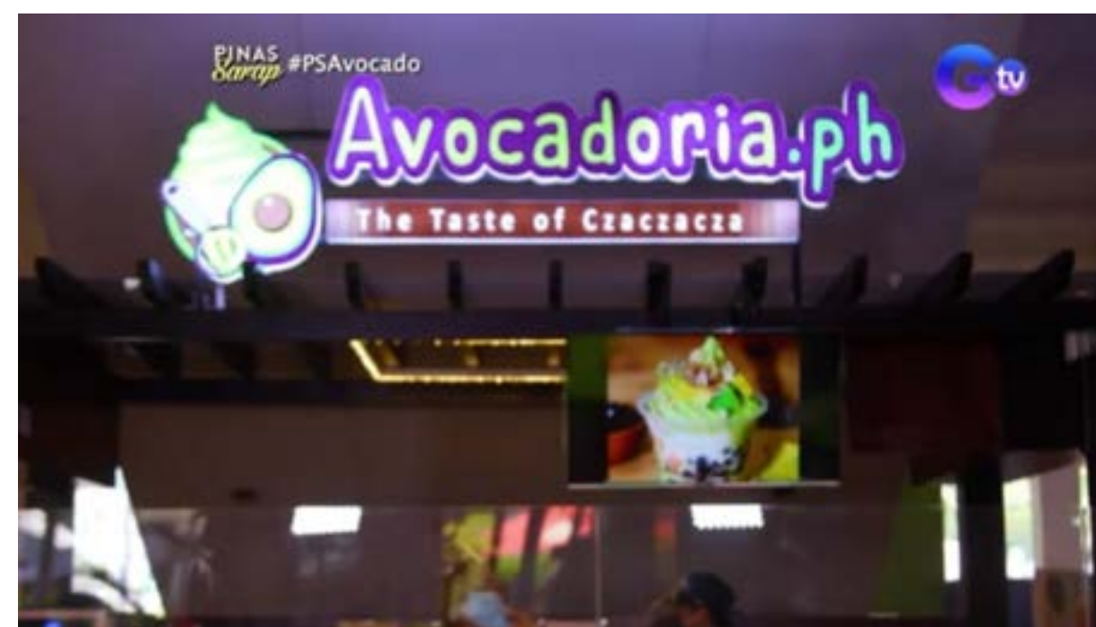
PINAS SARAP - GMA NEWS TV