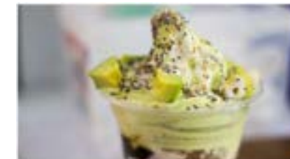
Avocadoria's Avocado Lover is an avocado treat made with avocado soft-serve, crushed graham, condensed toffee sauce, fresh avocado, almonds, chia, and the shell, mocha cream.

If you're an avocado fan, one of the more unique avocado creations you should try is the avocado cheesecake. Here we list down where you can try it, but take note that since avocados are seasonal (around May to September), it would be best to double-check beforehand if the avocado cheesecake is available.