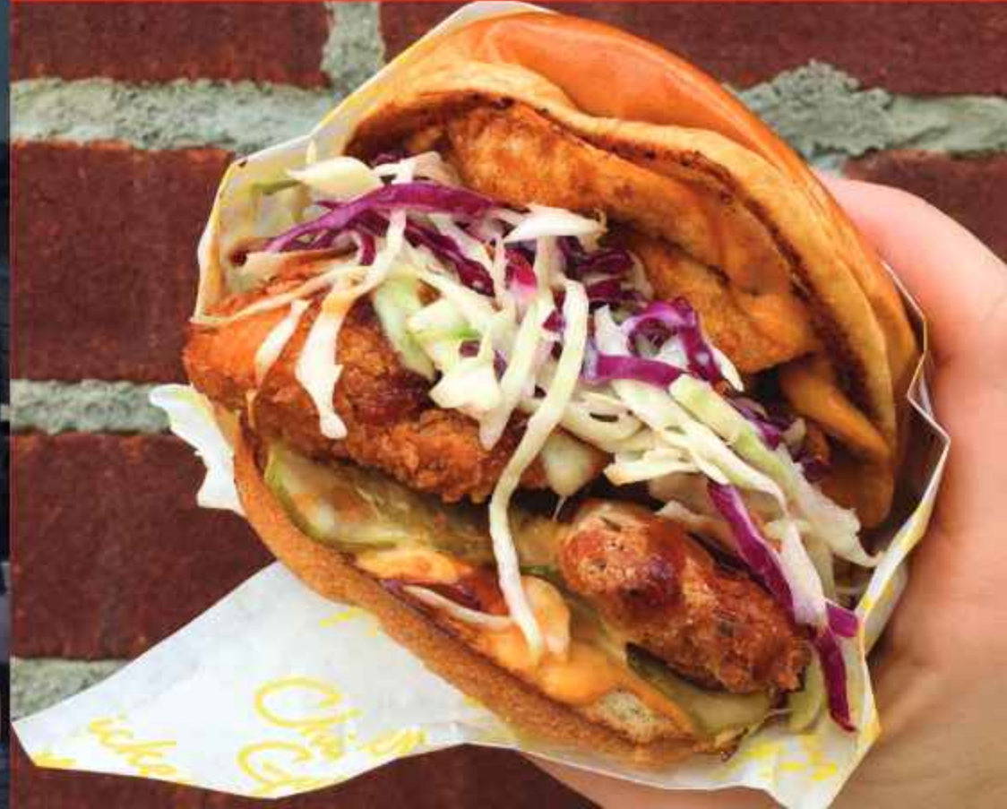
Chicken Guy!'s flagship restaurant opened in August 2018 in Disney Springs, located in the heart of Florida's Walt Disney World Resort.

"I've had the pleasure of getting to know Guy—first with the launch of his sandwich and burger menu at Planet Hollywood. Since then, we kept in touch, determined to work on a big project together, and here we are. We found the perfect venture with Chicken Guy!, a crowd-pleaser. I have personally tasted all the menu items and can't wait to open around the world, because our guests love what Guy has put on the menu," said Planet Hollywood Founder and Chairman Robert Earl.