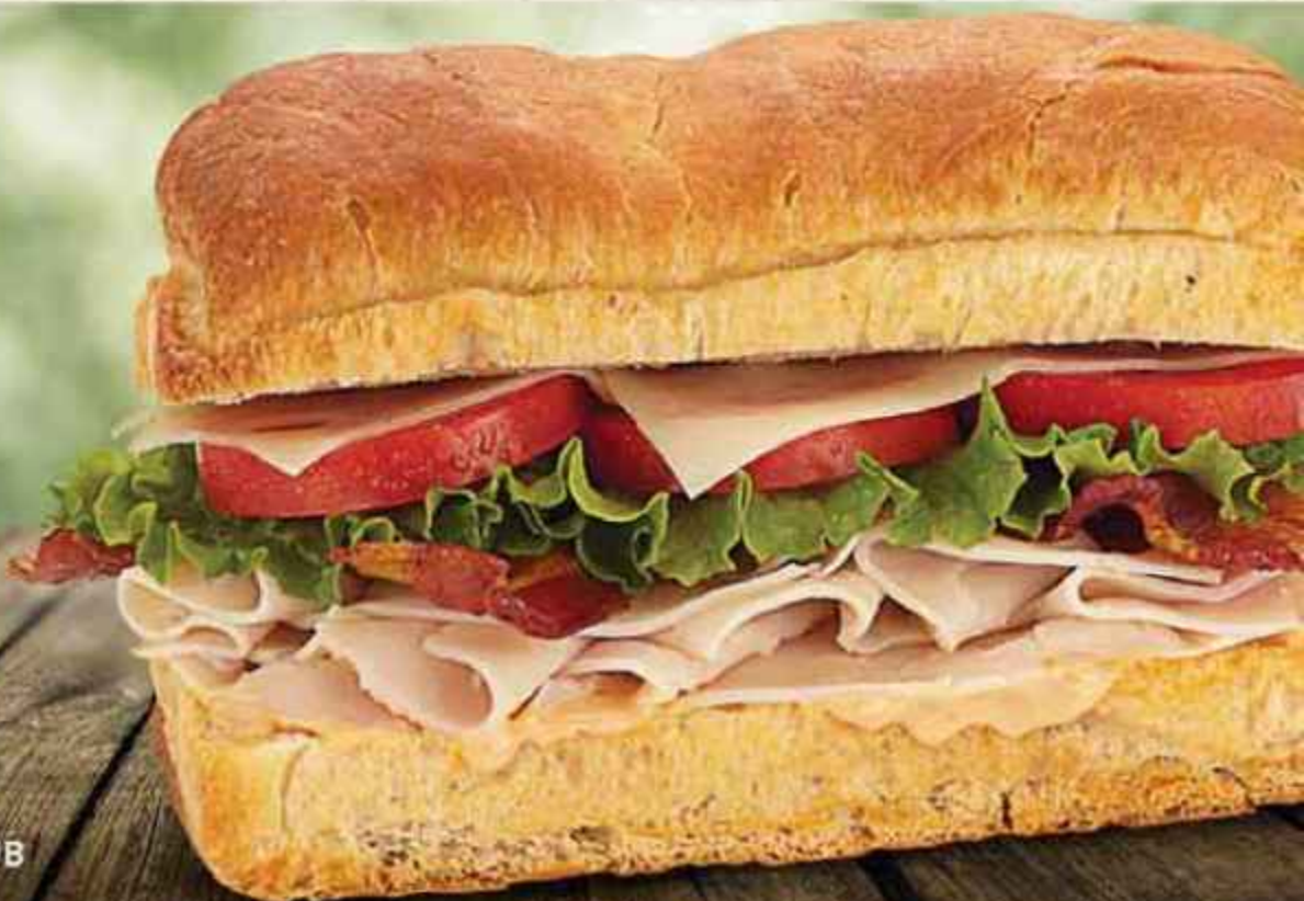
THE EARL'S CLUB