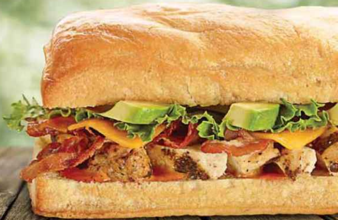
CHIPOTLE CHICKEN AVOCADO