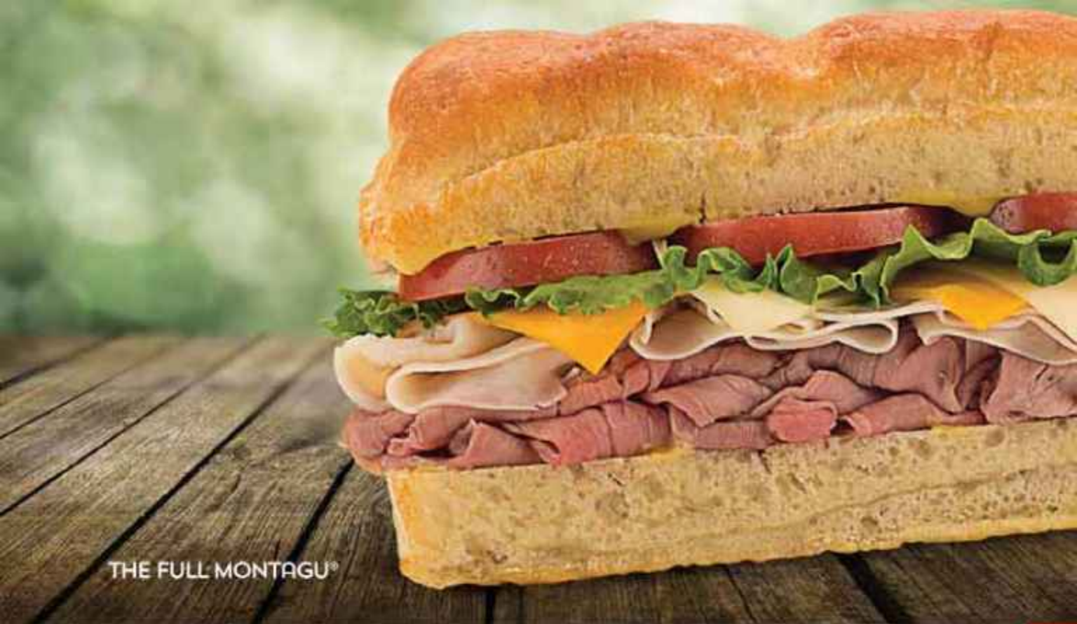
THE FULL MONTAGU®