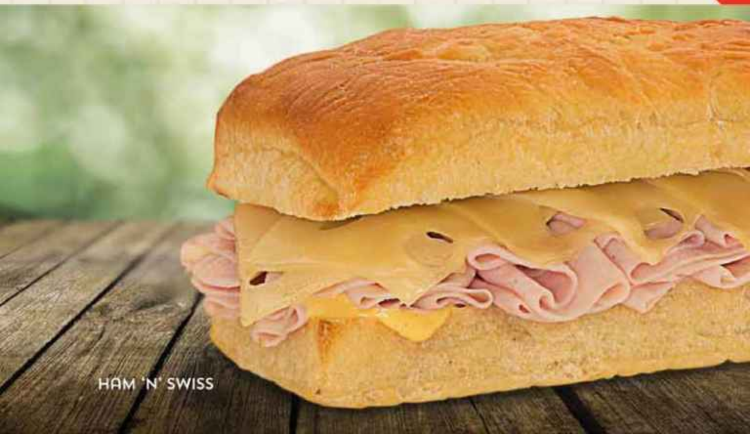
HAM 'N' SWISS