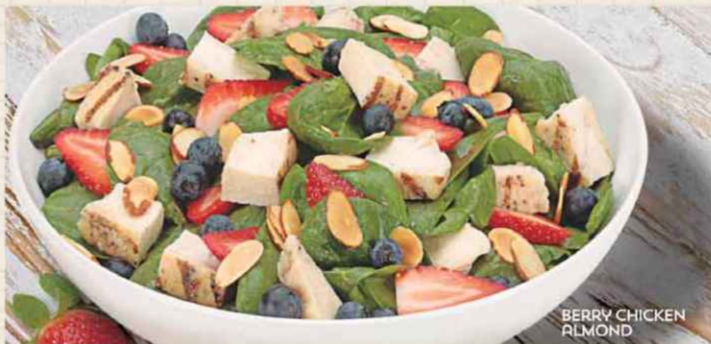
BERRY CHICKEN ALMOND

Freshly tossed greens, topped with fresh, ingredients and innovative flavor combinations.